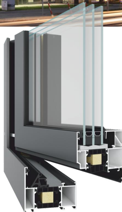
Photo: Corner House, Warszawa Project: Biuro Projektów Kazimierski i Ryba Sp. J., Warszawa Aluminium manufacturer: BUMA FACTORY, Kraków

Dedicated thermal insulators act as thermal insulation, in combination with infill of high thermal insulation properties.